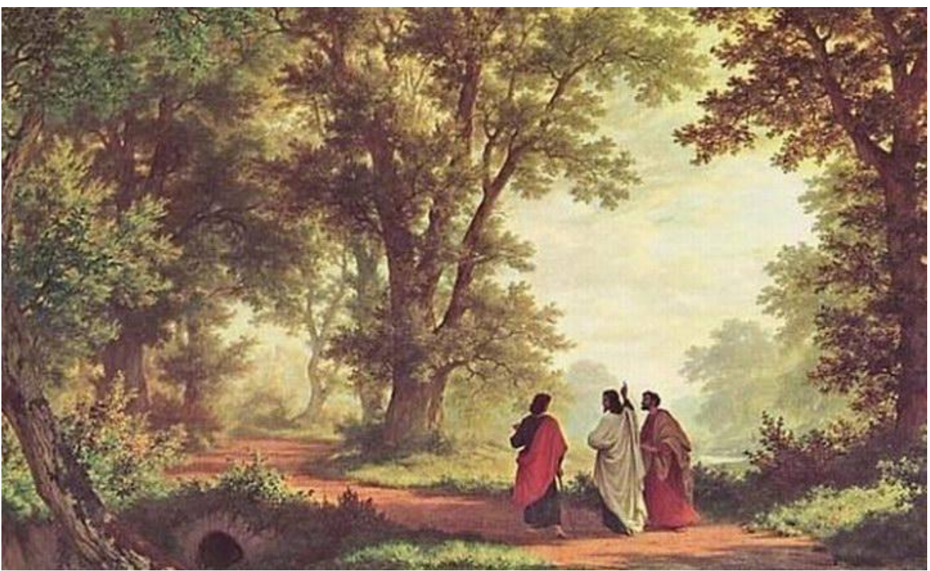
The Road to Emmaus.