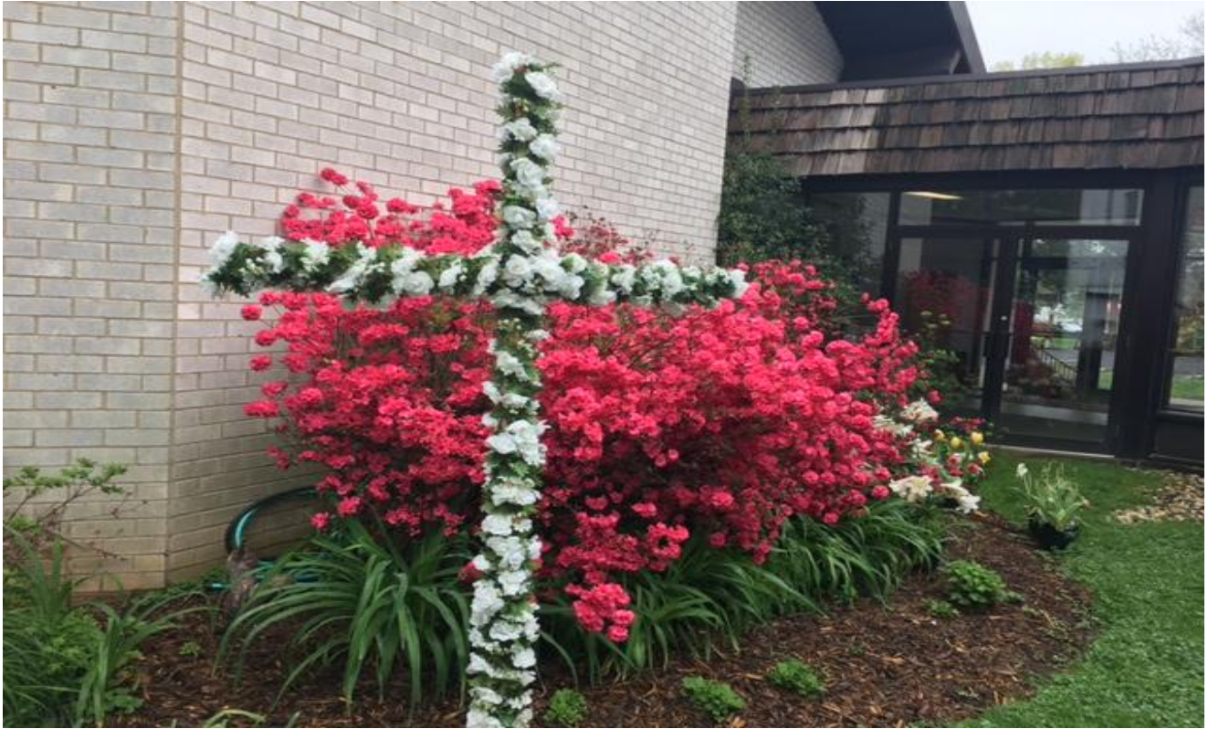
EASTER AT CELC - April 16th 2017.